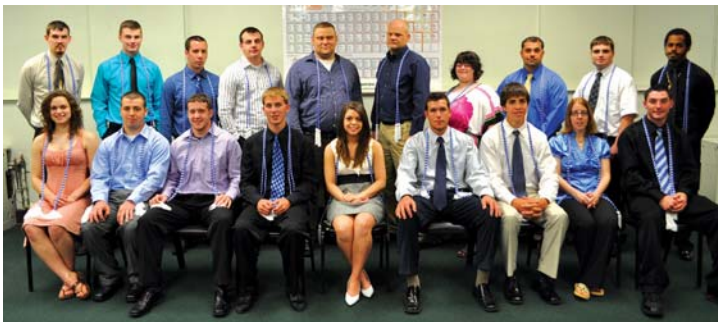
Newly Inducted Members of the Chi Alpha Epsilon Honor Society