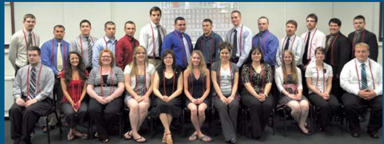
Newly Inducted Members of the Alpha Beta Kappa Honor Society