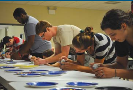
Above - Minute to Win it during August's Welcome Week.