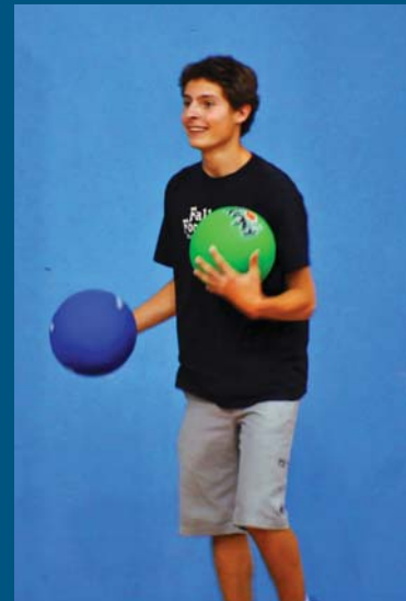
Right - Intramurals rule the gym nearly every Wednesday from 11am-1pm.