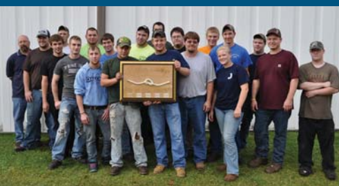
Above - Diesel Truck Technology students win the Tug O' War during September's Activity Day.