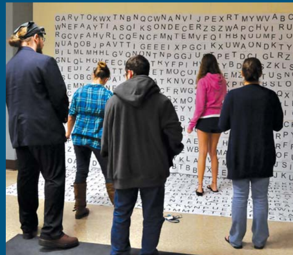
Above - Students search for the words of our Founding Fathers during Constitution Day.