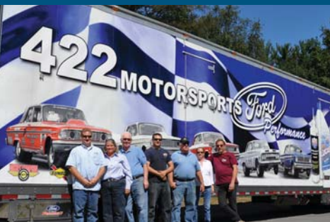
Left - 422 Motorsports had their Nostalgia Super Stock Fords on display.

The event raised a total of $5,277 for the Johnson College Cars on Campus Scholarship, exceeding the $5,000 goal!